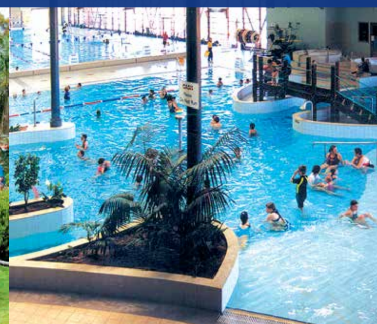
Oasis Recreational Centre