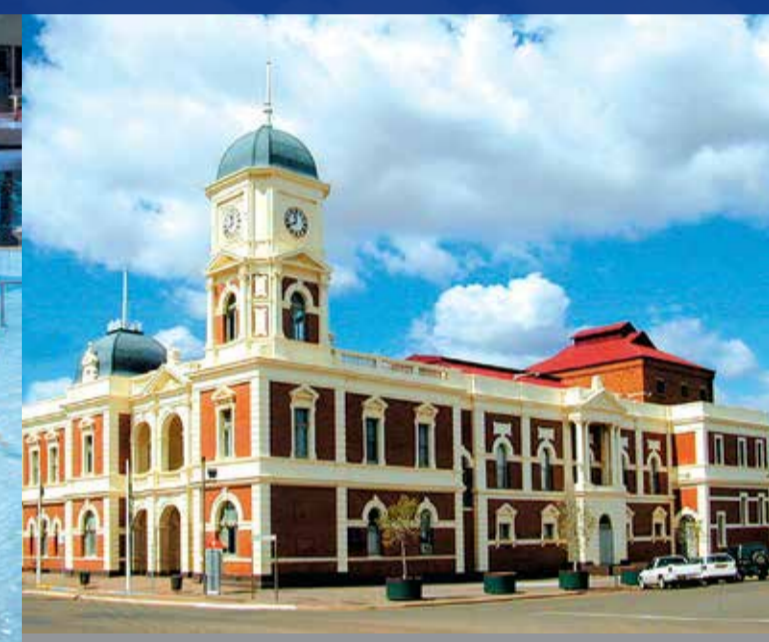
Boulder Town Hall