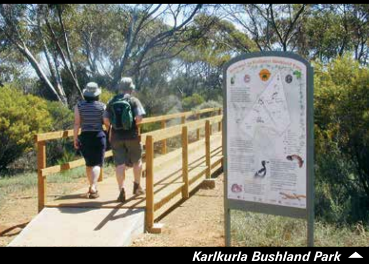
Karlkurla Bushland Park