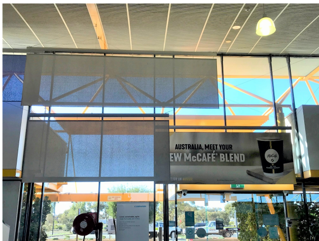
Top panel 38, bottom left 37, bottom right 36