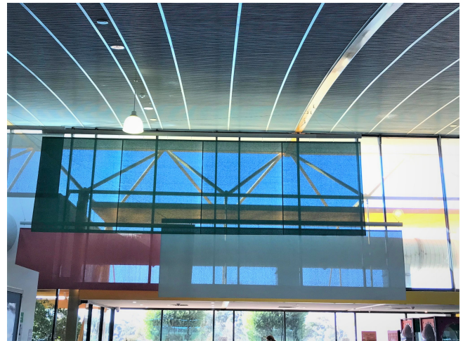
Top panel 40, bottom left 41, bottom right 39